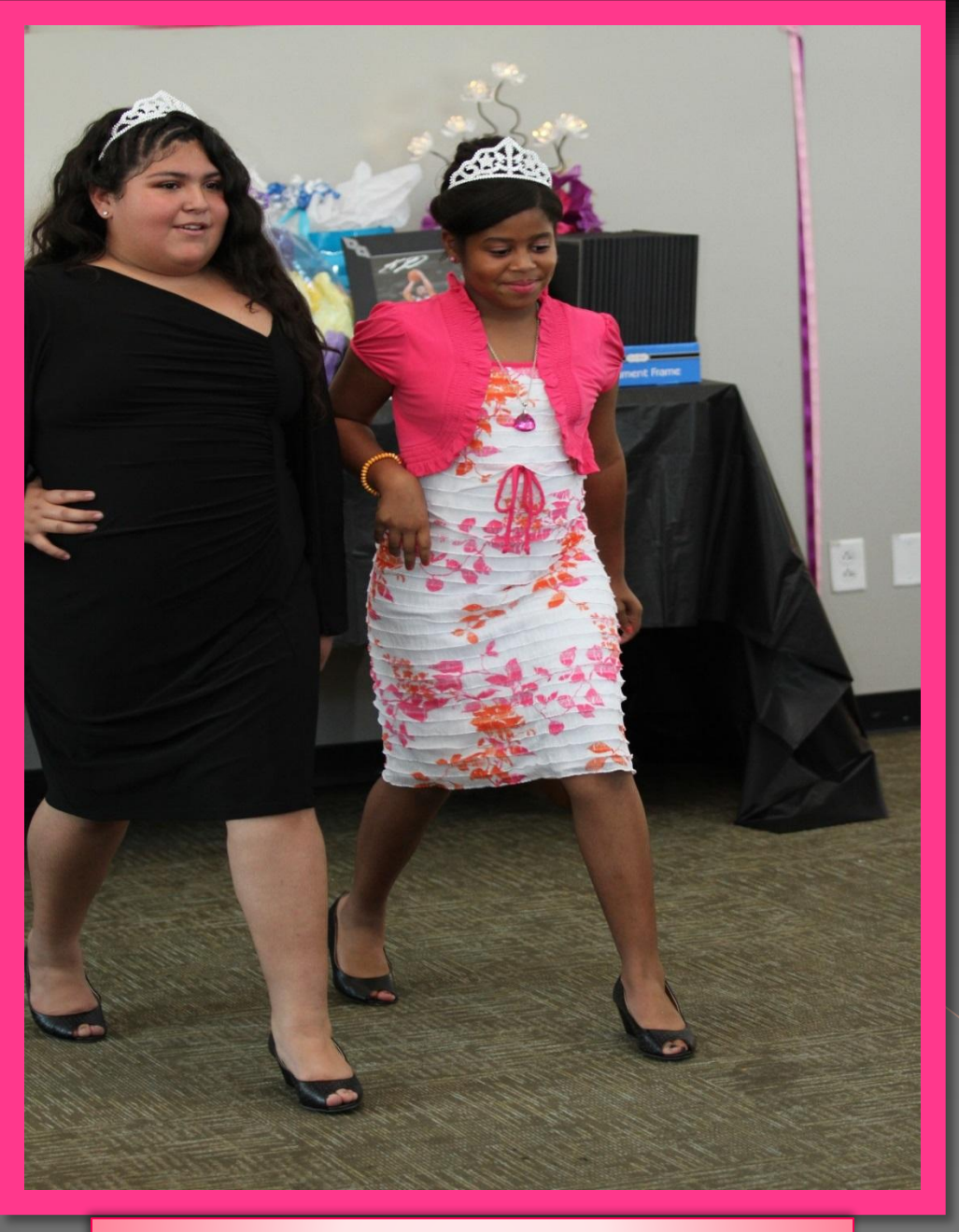
2015 MODE Fashion Show