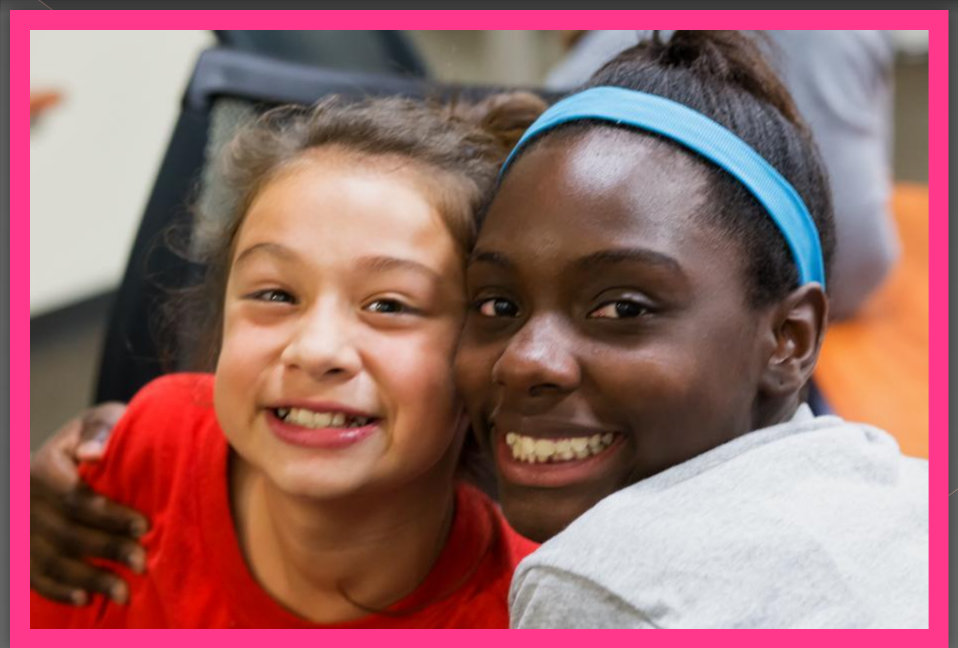
Nail & Hair Care Session