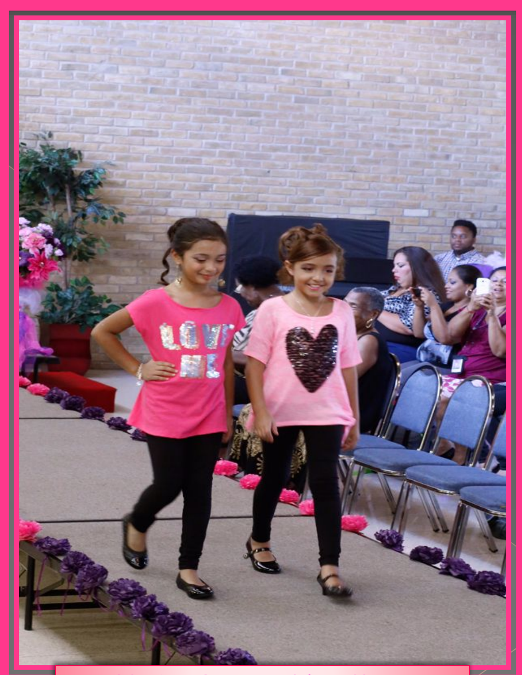
2016 MODE Fashion Show